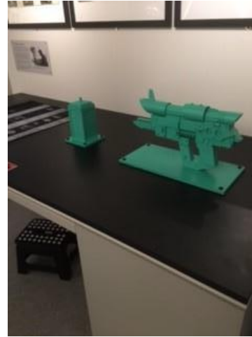
If I want to, I can touch models.