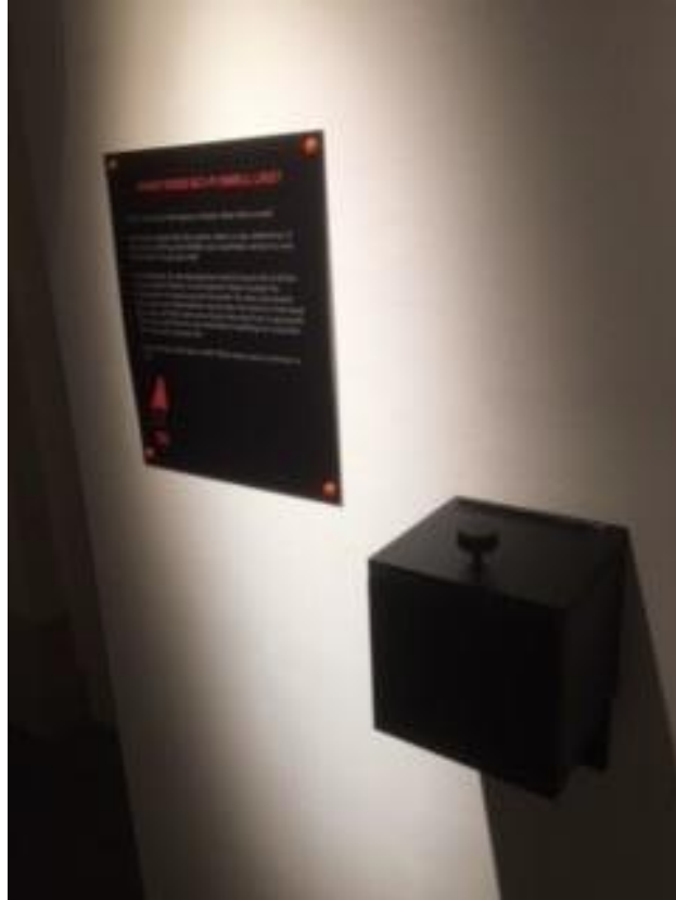
I can lift the lid on the box and smell the scent of outer space.